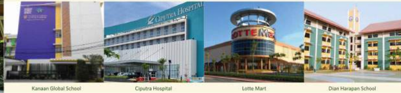
Kanaan Global School

Kemudahan akses tak dilupakan dengan adanya TOL SEDYATMO, TOL JORR, dan yang akan hadir TOL SEMANAN-SUNTER. Transportasi masal juga tersedia disekitar lokasi seperti KA dan Transjakarta memberikan nilai tambah bagi investasi Anda di Paradise Mansion.